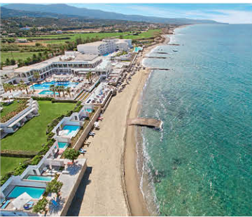
CRETE: LUX ME WHITE PALACE ★★★★★