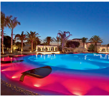
CRETE: CAMEL BOUTIQUE RESORT ★★★★★