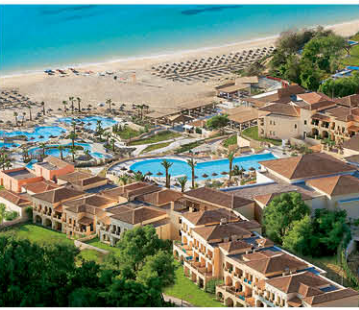
PELOPONNESE: OLYMPIA OASIS & AQUA PARK ★★★★★