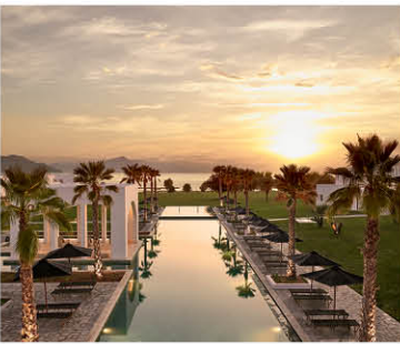
PELOPONNESE: NEW - CASA MARRON ★★★★★