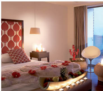
ATHENS: VOULIAGMENI SUITES ★★★★★