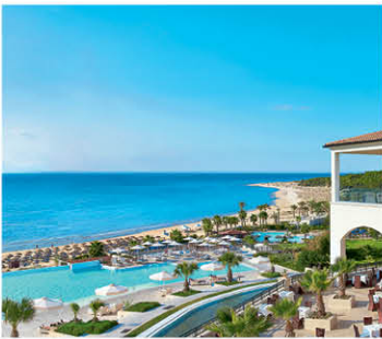
PELOPONNESE: OLYMPIA RIVIERA & AQUA PARK ★★★★★