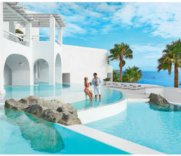
MYKONOS: MYKONOS BLU ★★★★★