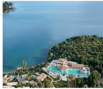
CORFU: EVA PALACE ★★★★★