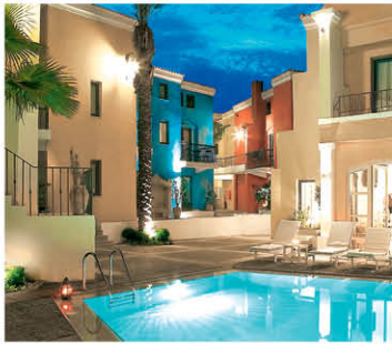
CRETE: PLAZA SPA APARTMENTS ★★★★★