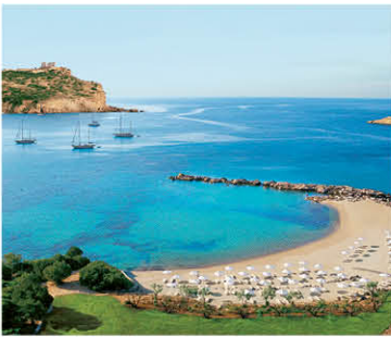
ATTIKA: CAPE SOUNIO ★★★★★