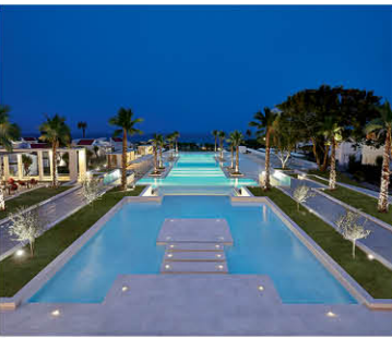
RHODOS: LUX ME RHODOS ★★★★★