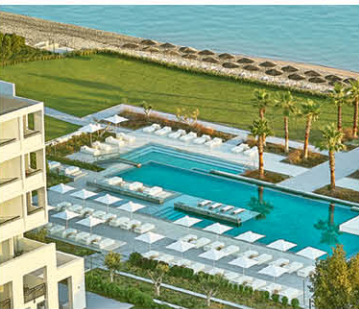
HALKIDIKI: PELLA BEACH ★★★★★