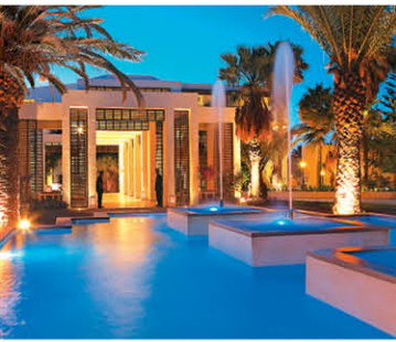
CRETE: CRETA PALACE ★★★★★