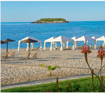
CRETE: MELI PALACE ★★★★★