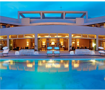
ALEXANDROUPOLIS: ASTIR*EGNATIA ★★★★★