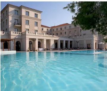
LARISSA: LARISSA IMPERIAL ★★★★★