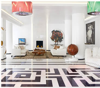
ATHENS: PALLAS ATHENA ★★★★★