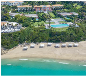
PELOPONNESE: MANDOLA ROSA & AQUA PARK ★★★★★