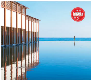
CRETE: AMIRANDES ★★★★★