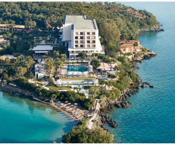
CORFU: CORFU IMPERIAL ★★★★★