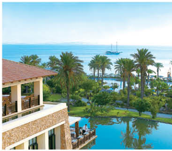
KOS: KOS IMPERIAL THALASSO ★★★★★