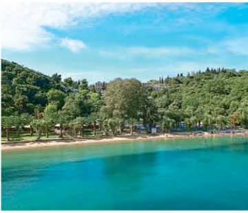
CORFU: LUX ME DAPHNILA BAY THALASSO ★★★★★