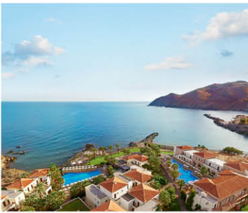
CRETE: CLUB MARINE PALACE & SUITES ★★★★★