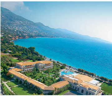
KALAMATA: FILOXENIA ★★★★★