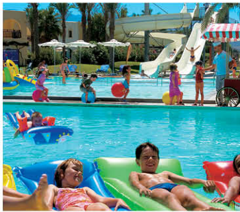
KOS: ROYAL PARK ★★★★★